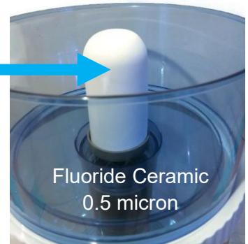
Fluoride Ceramic 0.5 micron Replace 12 monthly

UNSCREW FILTER ANTI-CLICK WISE FROM BOTTOM BOWL. UNDO NUT AT THE UNDER THE BOTTOM BOWL TO REMOVE STANDARD DOME. REPLACE WITH CERAMIC DOME