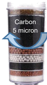
Carbon 5 micron

UNSCREW FILTER ANTI-CLICK WISE FROM BOTTOM BOWL. UNDO NUT AT THE UNDER THE BOTTOM BOWL TO REMOVE STANDARD DOME. REPLACE WITH CERAMIC DOME